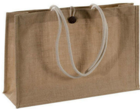
Figure 1. Jute bag [7].

– Paper bags: Paper bags are also an environmentally friendly alternative to plastic bags. It has been suggested that the natural fibers of the paper and its recyclability create a positive image of the paper bags. The natural fibers of the paper and the renewable resource used has a positive image, as the increase in the volume of the paper bags, likely to be sent to the landfill, has now taken over a new role in the recycling options which are firmly established. It has been scientifically proven that paper bags are not as harmful to the environment as plastic bags. The cost of one paper bag is 0.1$, and it is a feasible and effective alternative for a plastic bag.