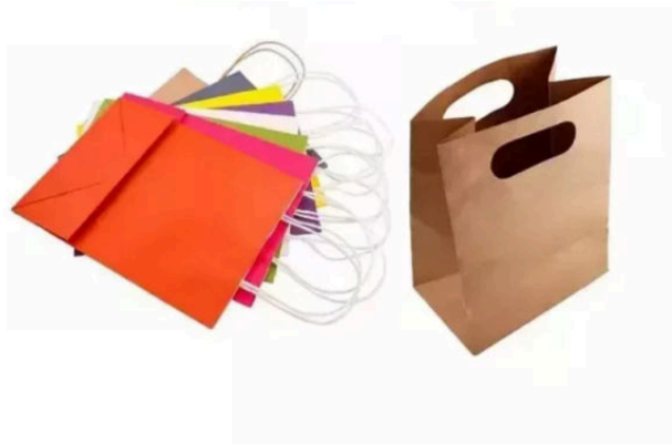
Figure 2. Paper bag [8].

– Paper bags: Paper bags are also an environmentally friendly alternative to plastic bags. It has been suggested that the natural fibers of the paper and its recyclability create a positive image of the paper bags. The natural fibers of the paper and the renewable resource used has a positive image, as the increase in the volume of the paper bags, likely to be sent to the landfill, has now taken over a new role in the recycling options which are firmly established. It has been scientifically proven that paper bags are not as harmful to the environment as plastic bags. The cost of one paper bag is 0.1$, and it is a feasible and effective alternative for a plastic bag.