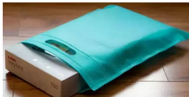
Figure 3. Nonwoven bag [9].

– Nonwoven bags: Nonwoven bags are a cheaper solution to paper bags. Although it is made from plastic, a nonwoven bag still has the possibility of recycling, is sturdy enough to hold a good number of products, and is an exemplary product.